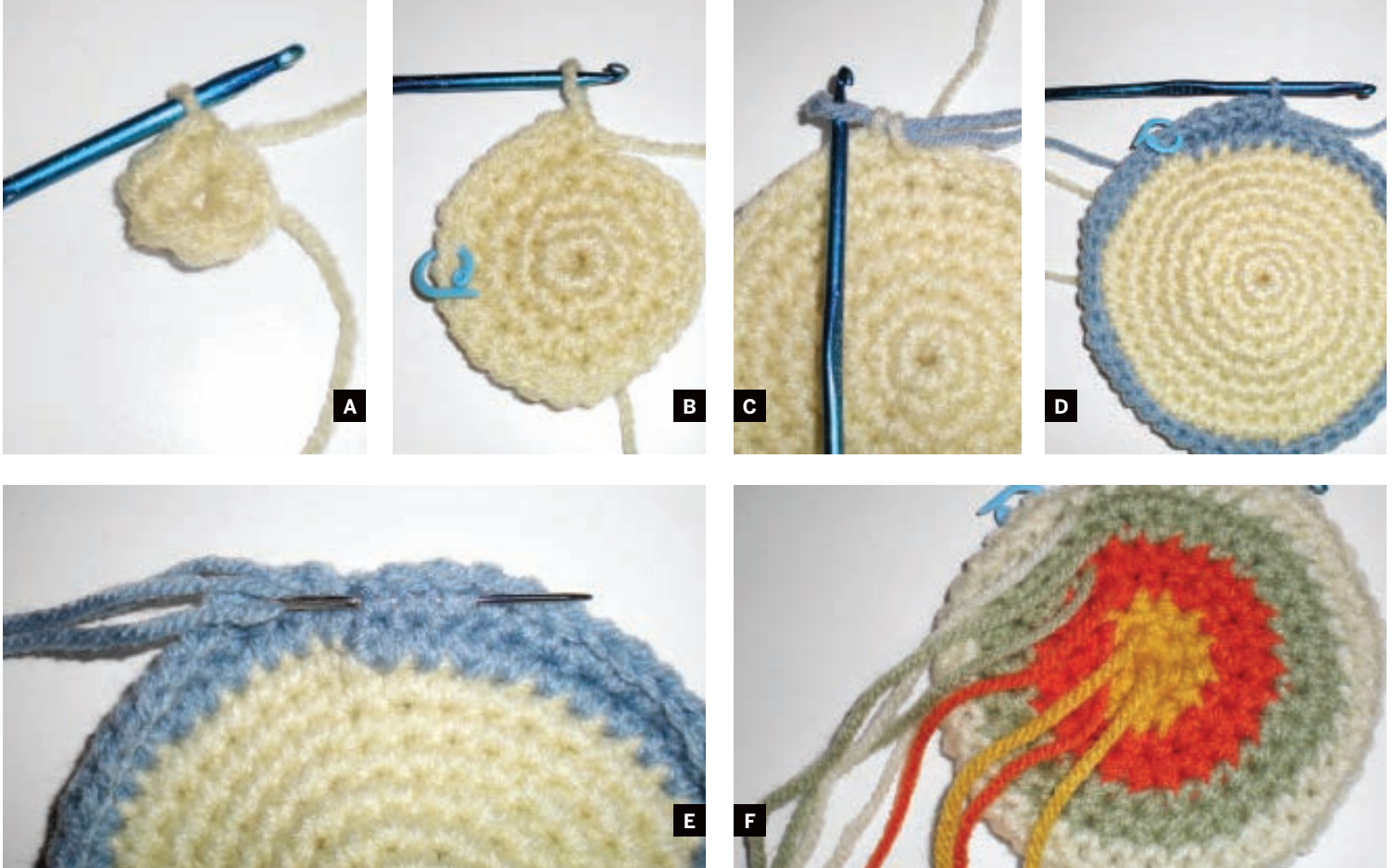
Fig. A: Add stitches into the starting ring to begin the monkey's face. Fig. B: Place a marker in the first stitch of each round so that you can distinguish the beginning of each round. Figs. C and D: Add the first contrast